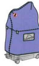
Robot TDIC #15701