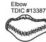
Elbow TDIC #13387