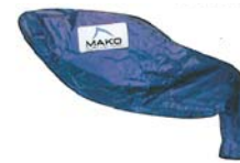
Vision System TDIC #13437