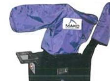
Robot TDIC #13385