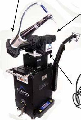
Shoulder Brake TDIC #13388